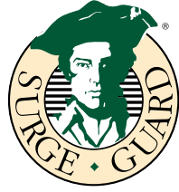
Meter-Based Surge Protection

A power surge has many causes, the most obvious is lightning, but a majority of surges are caused by birds, animals, and trees interfering with power lines. Even your refrigerators, vacuum cleaner or hair dryer can cause momentary internal surges. And surges vary in intensity. While a forceful surge can destroy an appliance, a faint surge may only dim your lights momentarily. Help to reduce the risk of costly repairs and prolong the life of your appliances and electronics by using the Surge Guard program.